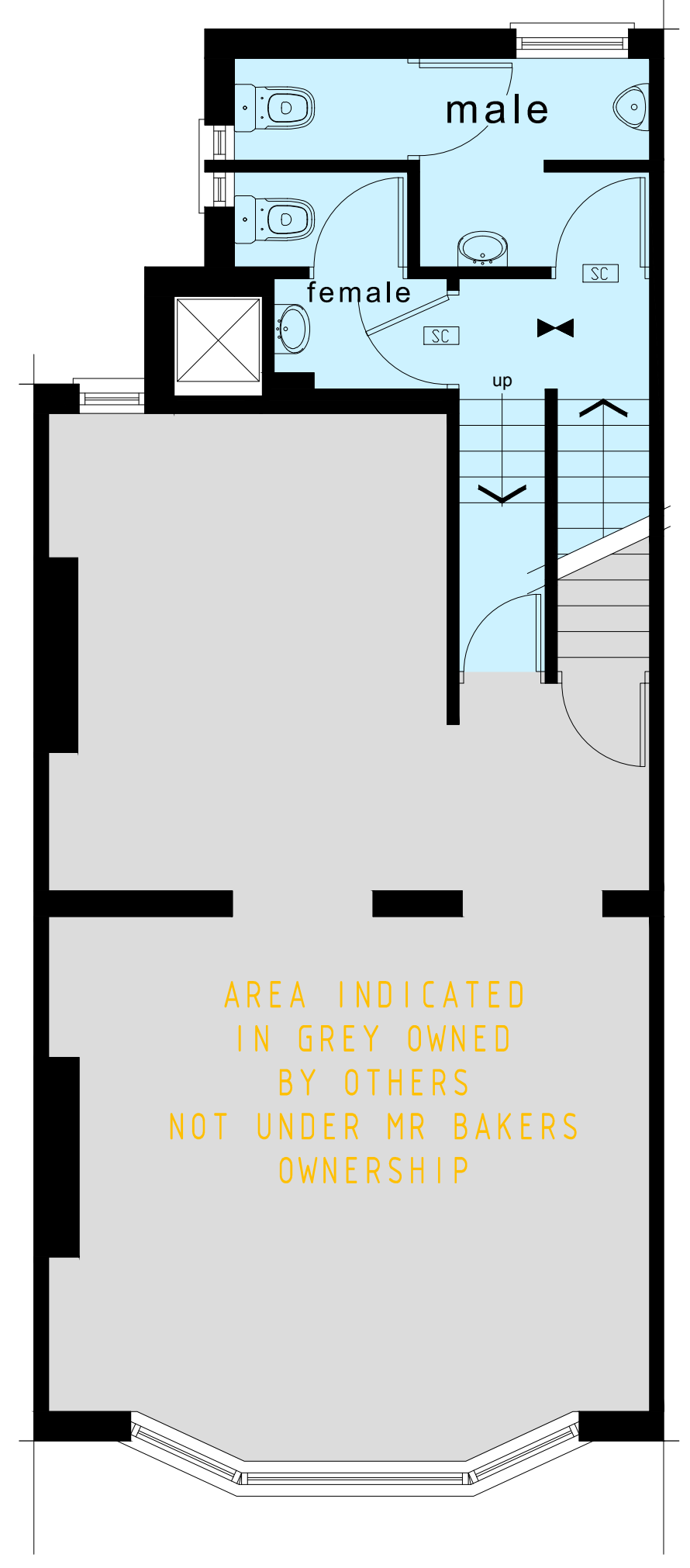
FIRST FLOOR PLAN 1:50

Client: Mr O Baker Location: Twelve Bar 12 Cliff Town Road Southend on Sea Essex SS1 1AB Project: LICENCE DRAWING FLOOR + LOCATION PLANS Drawn: Scale: VARIOUS Drawing No: 22.106/L01 Checked: Date: January 2022 Rev: B